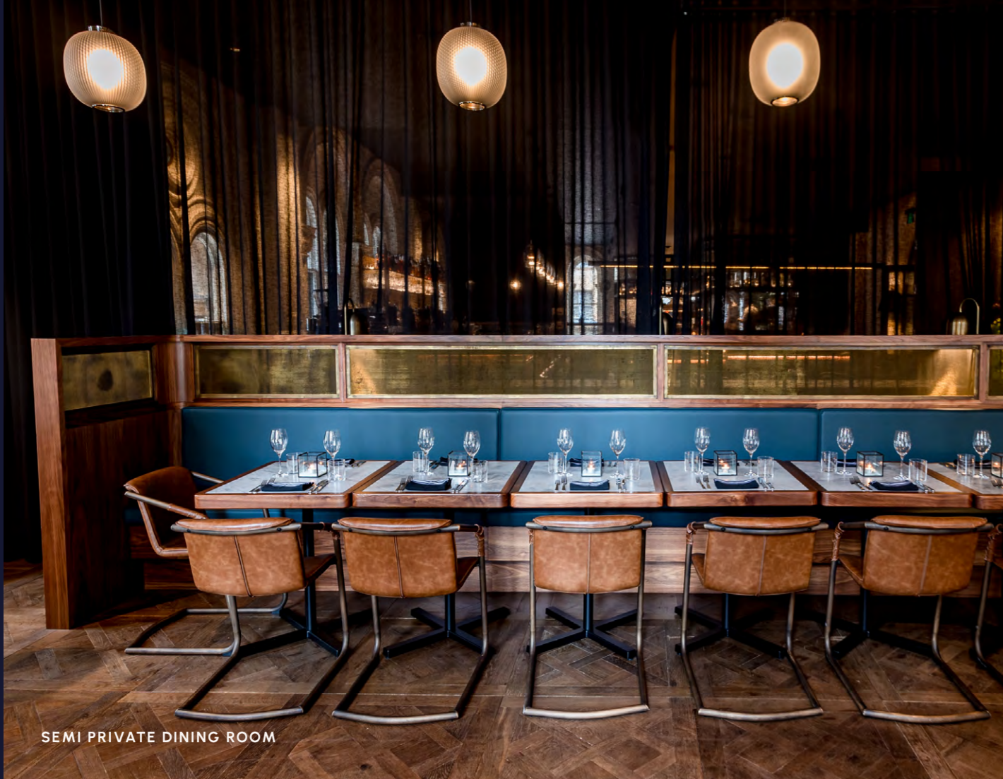
SEMI PRIVATE DINING ROOM